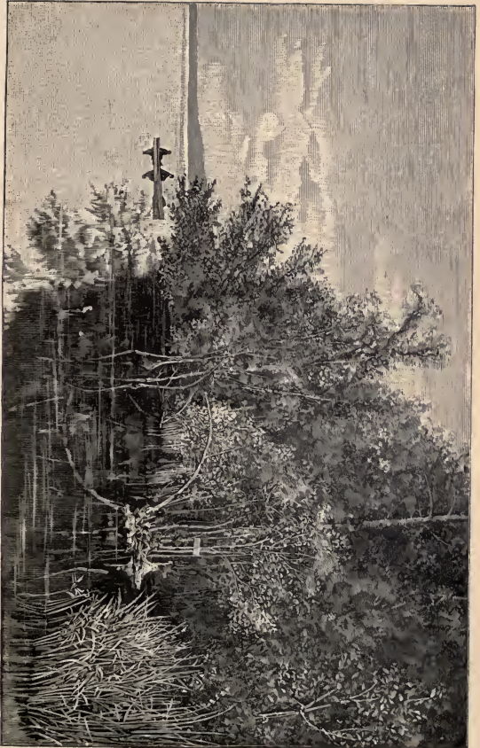
LAKE DRUMMOND, DISMAL SWAMP, VIRGINIA.